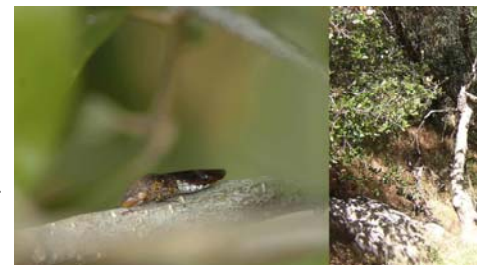
The Abundance of Live Oaks Probably Plays a Major Role in Winter Sharpshooter Survival in